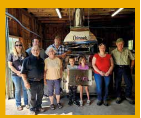
GUNNEBROOKE FARM Elgin, Ontario 3600 taps CHINOOK wood evaporator